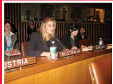
Addressing the UN